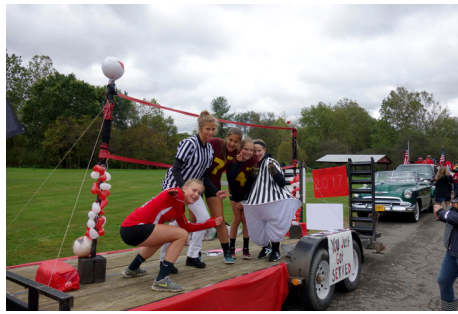
Students show their talents building and riding parade floats!